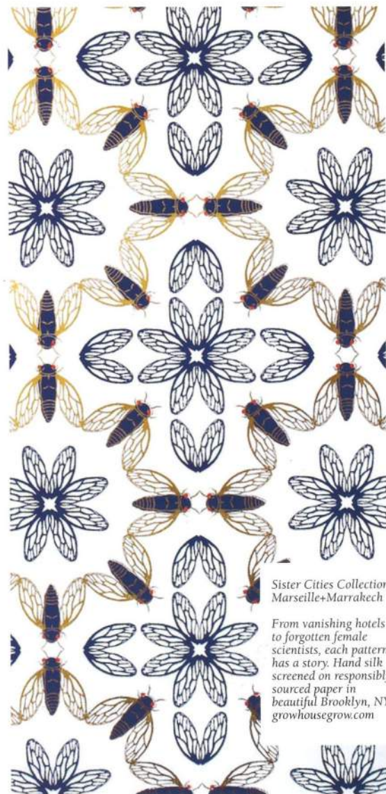
Sister Cities Collection: Marseille+Marrakech

From vanishing hotels to forgotten female scientists, each pattern has a story. Hand silk screened on responsibly sourced paper in beautiful Brooklyn, NY. grouhousegrow.com