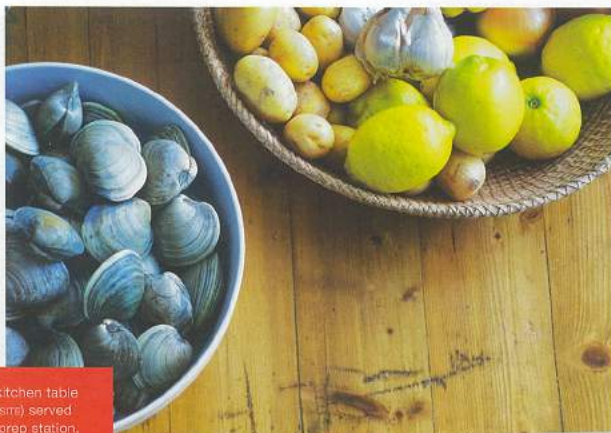
The kitchen table (opposite) served as a prep station. Fresh clams, endive, and potatoes confit await their close-up (this page), along with a pre-set table and place cards, hand-drawn by Zeff's daughters, Wyeth and Saffron.